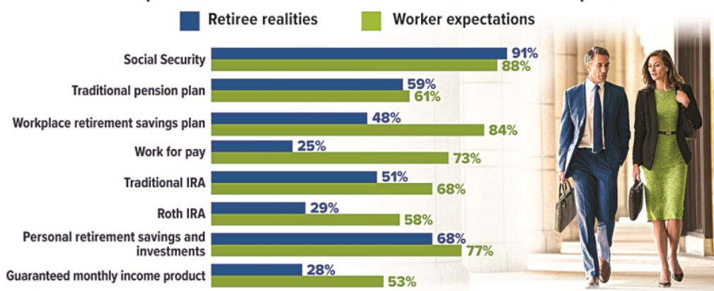
Worker expectations for retirement income vs. retirees' actual experience